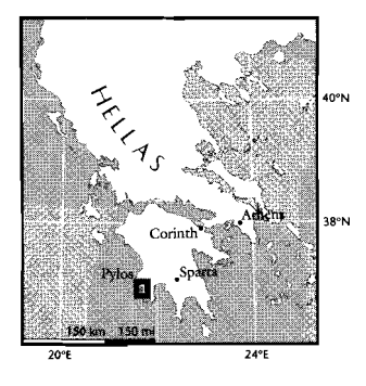
MAP 4.8 POSSIBLE LOCATIONS FOR THE "HARBOR" AT PYLOS

Pylos and the Athenian fortifications, and for eight or nine ships on that next the mainland on the other side: for the rest, the island was entirely covered with wood, and without paths through not being inhabited, and about fifteen stades in length.<sup>6b</sup> [7] The Spartans meant to close the entrances with a line of ships placed close together with their prows turned toward the sea and, meanwhile, fearing that the enemy might make use of the island to operate against them, carried over some hoplites <sup>7a</sup> to it, stationing others along the coast. [8] By this means both the island and the continent would be hostile to the Athenians, as they would be unable to land on either; and since the shore of Pylos itself outside the inlet toward the open sea had no harbor, there would be no point that the Athenians could use as a base from which to relieve their countrymen. Thus the Spartans would in all probability become masters of the place without a sea fight or risk, as there had been little preparation for the